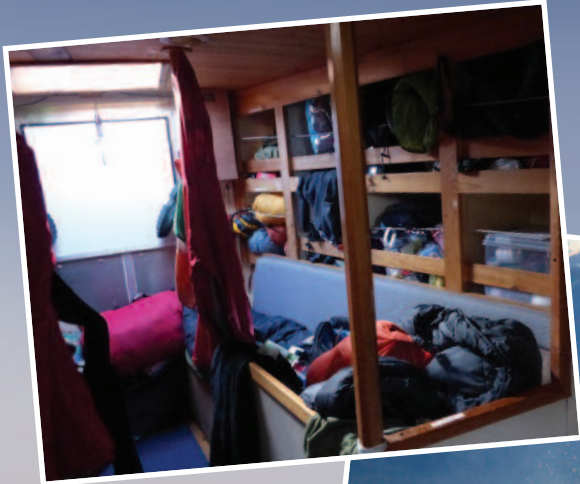
Left: The somewhat cramped quarters below deck.