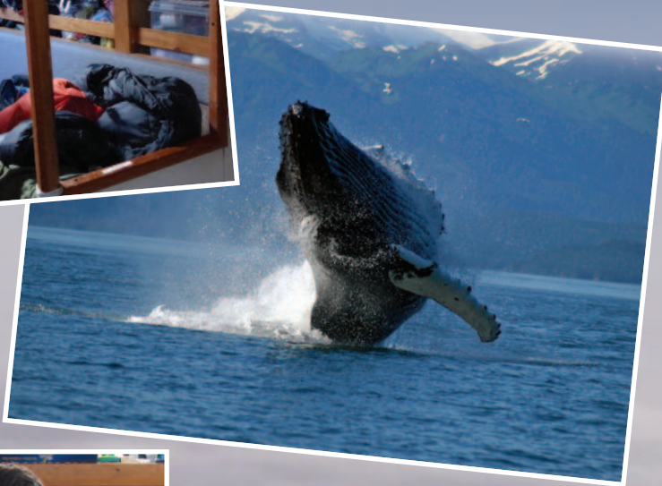
Above: A humpback whale breaching.